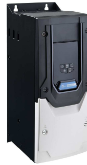
AC Drive VD i 1100 ... 16000/3Pro/IP55